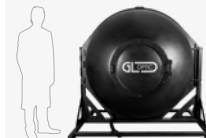
GL OPTI SPHERE 1500