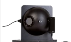
GL OPTI SPHERE 205