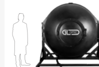
GL OPTI SPHERE 2000