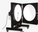
GL OPTI SPHERE 500