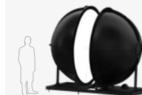
GL OPTI SPHERE 3000